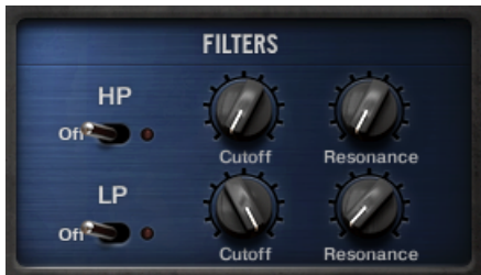
The Filter controls.