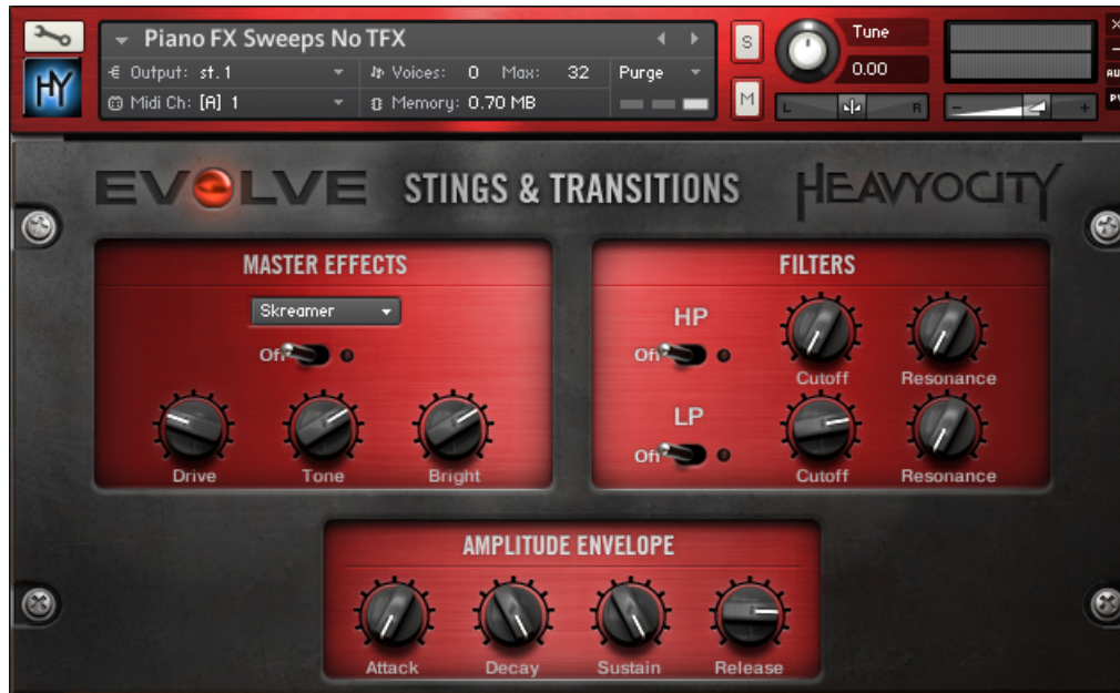
The Strings and Transitions interface.

Are you in need of some new creative tools to help captivate the attention of your audience? You've come to the right place! The stings and transitions of EVOLVE provide what we've felt has been absent from many of the current virtual instruments. Take no prisoners as you unleash hordes of sonic textures from both tonal and atonal/percussive worlds. The signature stings and transitions are set to deepen the emotion of any track. Whether it be a terrifying sonic punctuation in a film soundtrack, or an otherworldly gesture in the breakdown of a pop song, unique new signatures await!