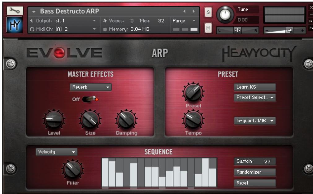
The Arpeggiated Instruments interface.

You control the rhythmic and tonal playing fields with EVOLVE's custom step-sequence arpeggiator. Grab one of the pre-programmed groove maps as you set one of the nearly 60 instruments loose. Experimental groove creation not only comes easily and quickly, but also produces a diverse range of interesting sonic results. We custom-scripted the step sequencer and set up intuitive, user friendly controls (velocity, filter, pan to name a few). The end-result introduces percolating swirls of percussion and tonality.