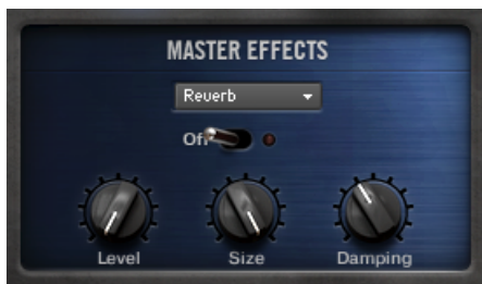
The Reverb effect controls.