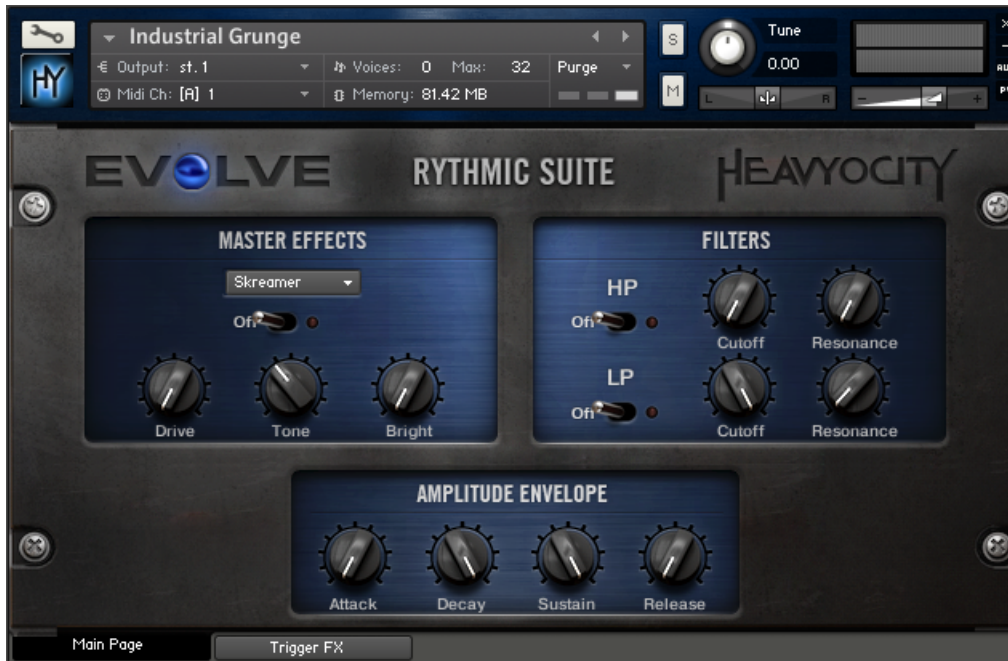
The Rhythmic Suite interface.

There's no better place to begin than with the diverse rhythmic loop suites ready to explode from EVOLVE. Thunderous walls of driving cinematic percussion, wickedly tricked-out punchy beats, odd otherworldly percolations and next-gen tonal elements make up seven genre-based instruments. In all, there is well over 600 original tempo-synced beat-sliced loops as well as a one massive tonal loop suite (in addition to breakdowns). The genres covered are: