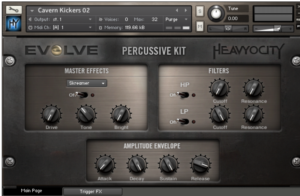
The Percussive Kits interface.

There are more than 30 modern percussive-type menus and kits in EVOLVE. We took great pride in beating droves of inanimate objects senseless to create this powerful array of percussive elements. Raw sounds were obtained in some strange and unique places. From a huge warehouse, to an amusement park midway, to a dark murky stairwell, to the whisper quiet confines of the New York City's Heavy Melody Studios, the diversity shines through in these unique and eclectic percussion instruments. Whether it's a massive impacting hit, or a subtly hand-crafted rhythm, a truly impacting sonic feast awaits!