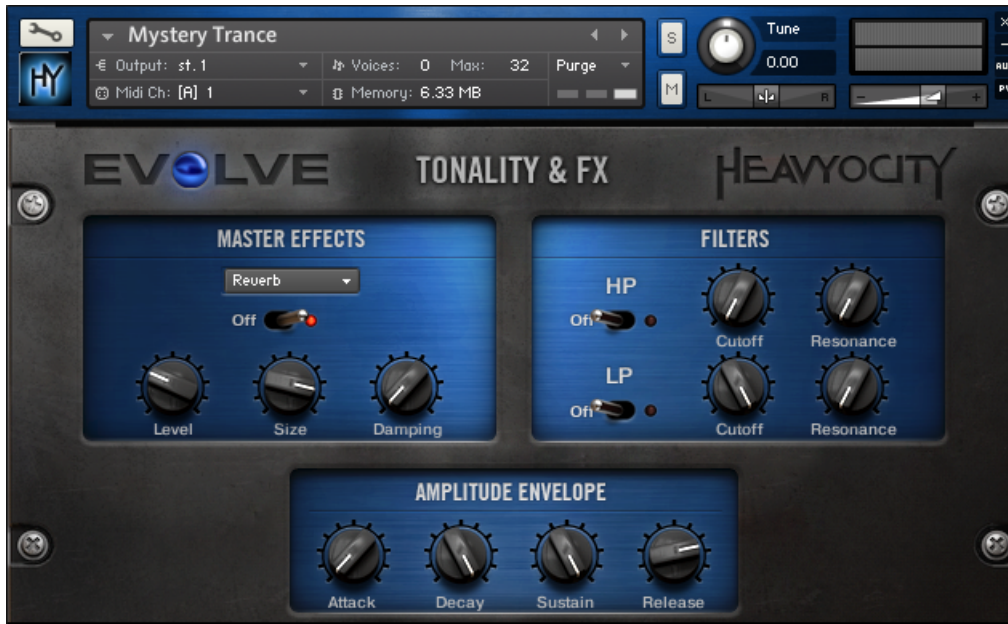
The Tonality and FX interface.

EVOLVE's percussive tour de force is balanced with a tripped out, mashed up array of music and sound design instruments and elements. They tend to stray from the more traditional "meat and potatoes" offerings that composers have well-covered in their library collections. In turn, EVOLVE fills these overlooked tonal nooks and crannies. From organic otherworldly soundscapes, to blistering synthetics and gnarled-out pads, the eclectic vibe of EVOLVE's tonality and sound design is sure to inject unique new mood and melody to your next project.